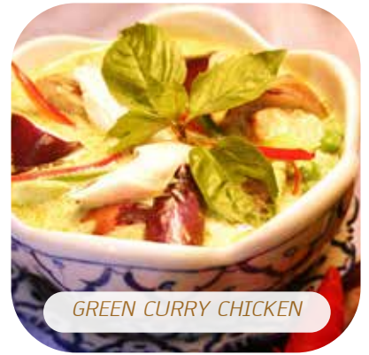
GREEN CURRY CHICKEN