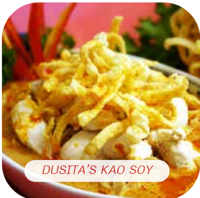
DUSITA'S KAO SOY