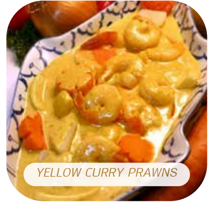
YELLOW CURRY PRAWNS