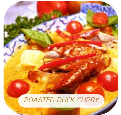
ROASTED DUCK CURRY