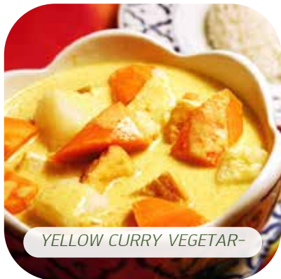
YELLOW CURRY VEGETAR-