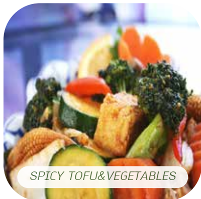
SPICY TOFU & VEGETABLES