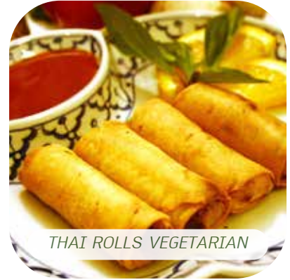
THAI ROLLS VEGETARIAN