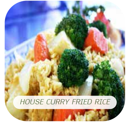
HOUSE CURRY FRIED RICE