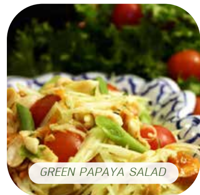
GREEN PAPAYA SALAD