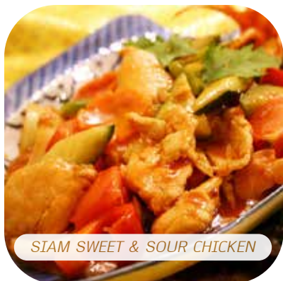
SIAM SWEET & SOUR CHICKEN