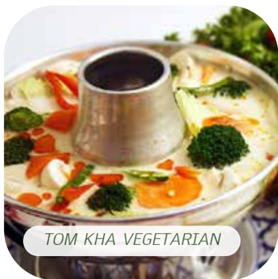
TOM KHA VEGETARIAN