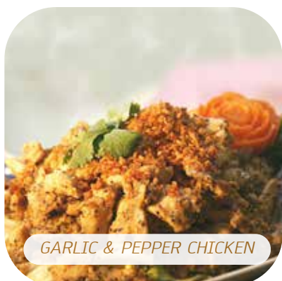
GARLIC & PEPPER CHICKEN