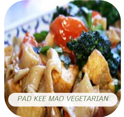
PAD KEE MAO VEGETARIAN