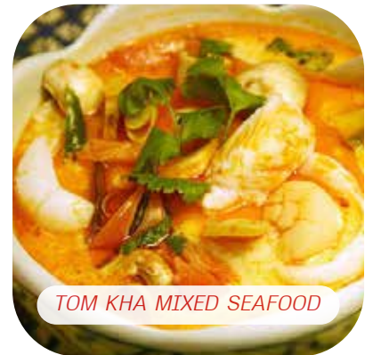
TOM KHA MIXED SEAFOOD