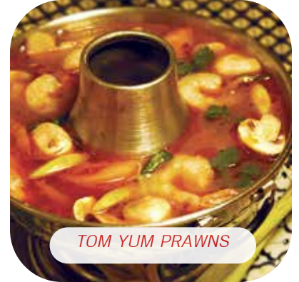
TOM YUM PRAWNS