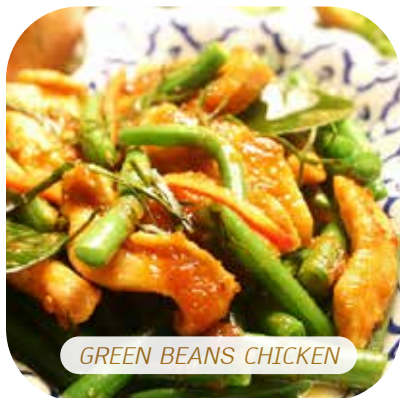
GREEN BEANS CHICKEN