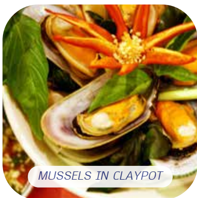
MUSSELS IN CLAYPOT