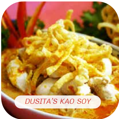
DUSITA'S KAO SOY