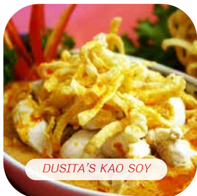
DUSITA'S KAO SOY