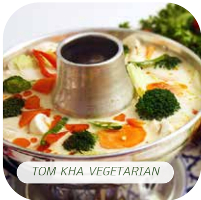
TOM KHA VEGETARIAN