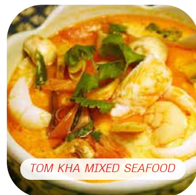
TOM KHA MIXED SEAFOOD