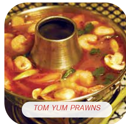
TOM YUM PRAWNS